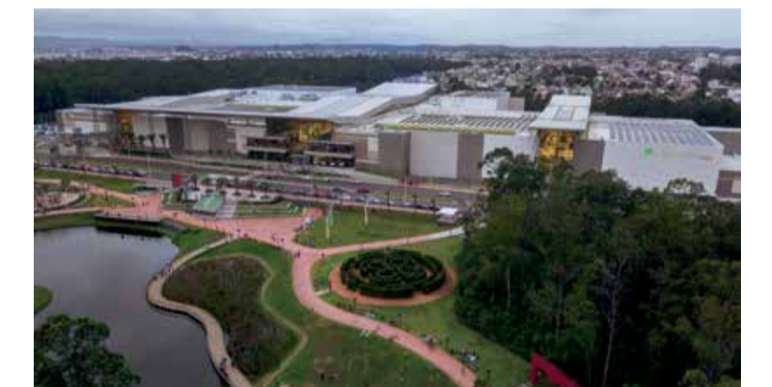
ParkShoppingCanoas - RS