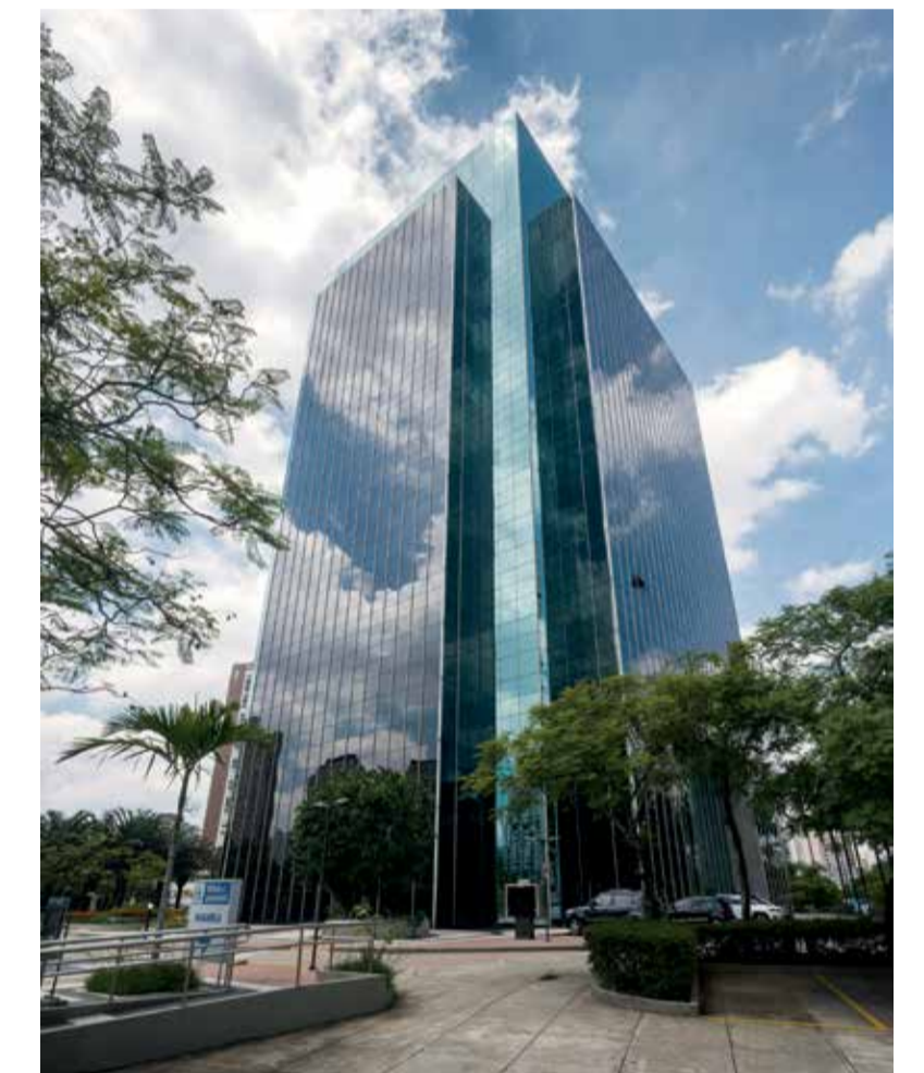
Morumbi Office Tower - SP