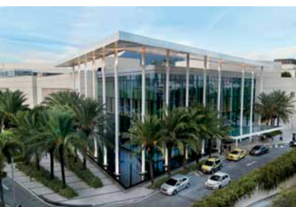
VillageMall - RJ