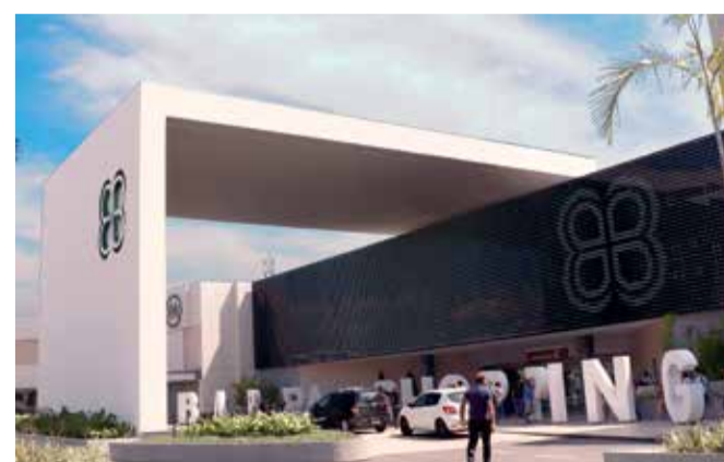
BarraShopping - RJ