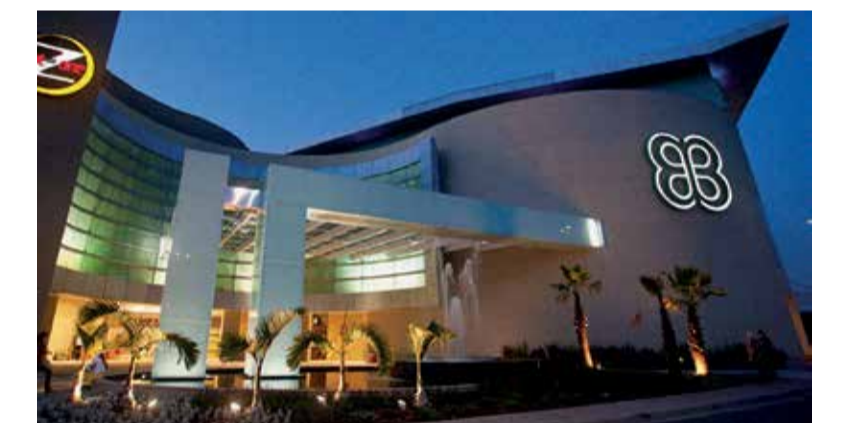
ParkShoppingBarigüi - PR