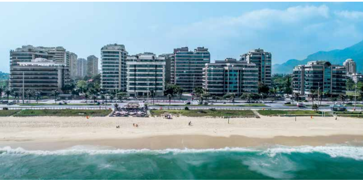
Barra Golden Green - RJ