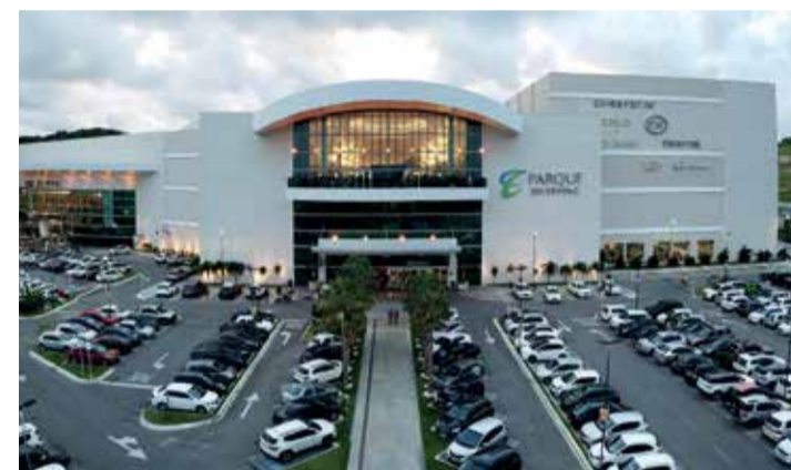
Parque Shopping Maceió - AL