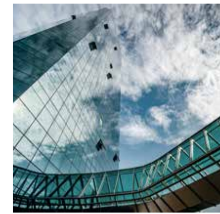
Cristal Tower - RJ