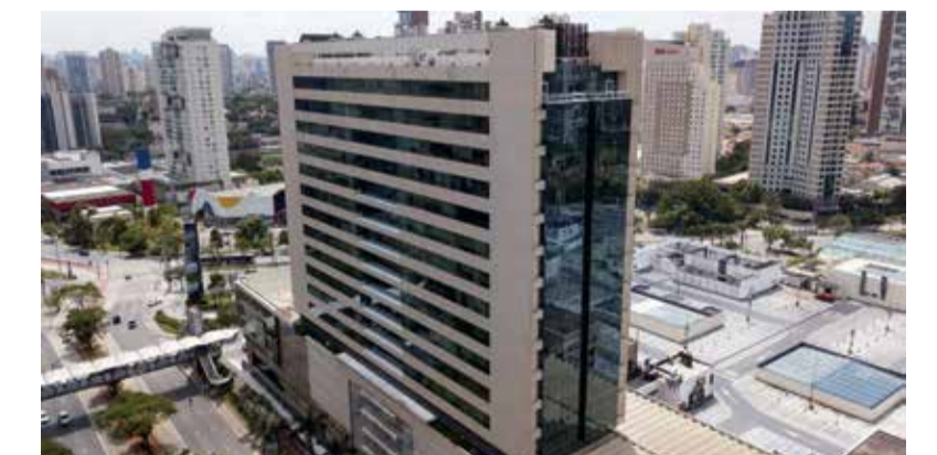
Centro Profissional Morumbi Shopping - SP