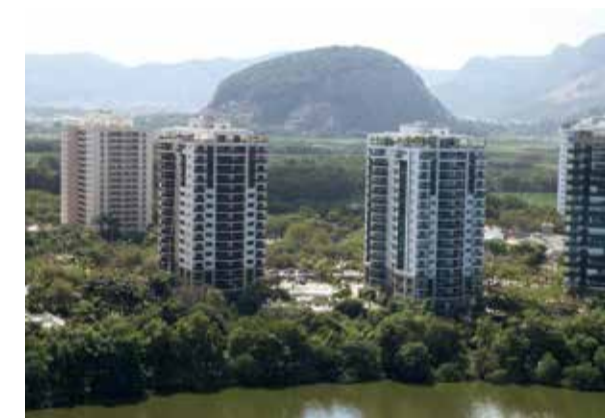
Península Green - RJ