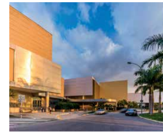
ParkShoppingSãoCaetano - SP