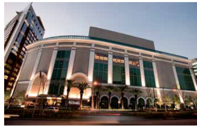
ShoppingVilaOlímpia - SP