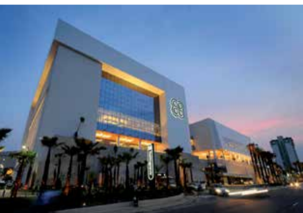
JundiaíShopping - SP