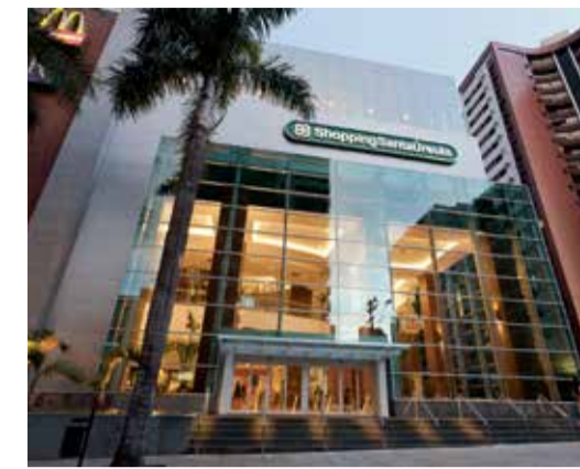
ShoppingSantaÚrsula - SP