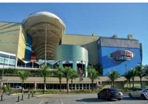
NewYorkCityCenter - RJ