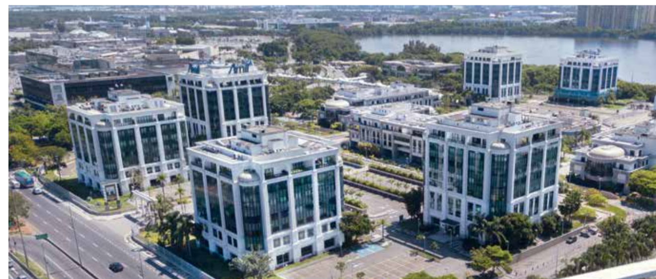
Centro Empresarial Barra Shopping - RJ