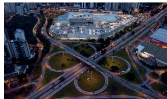
BH Shopping - BH