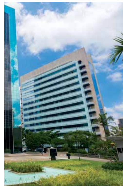
Morumbi Business Center - SP