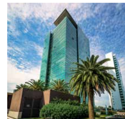
Diamond Tower - RJ