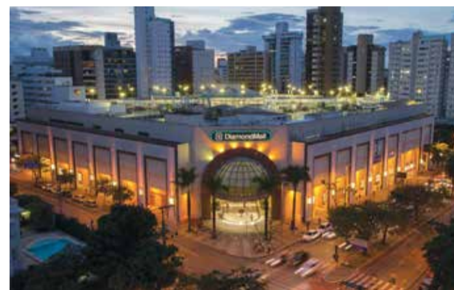
DiamondMall - MG