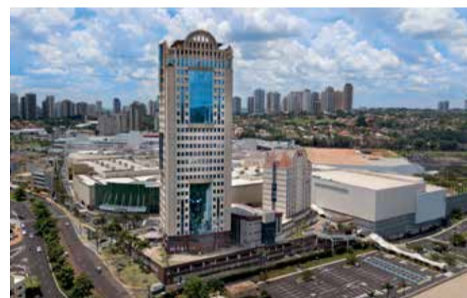
RibeirãoShopping - SP