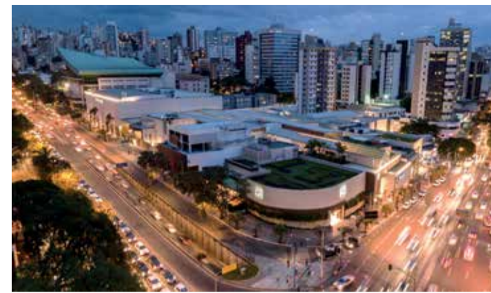
Pátio Savassi - MG