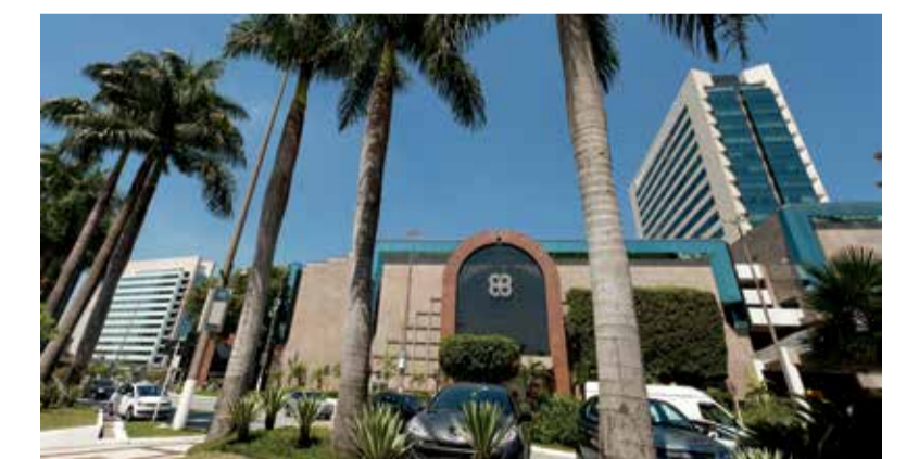
MorumbiShopping - SP