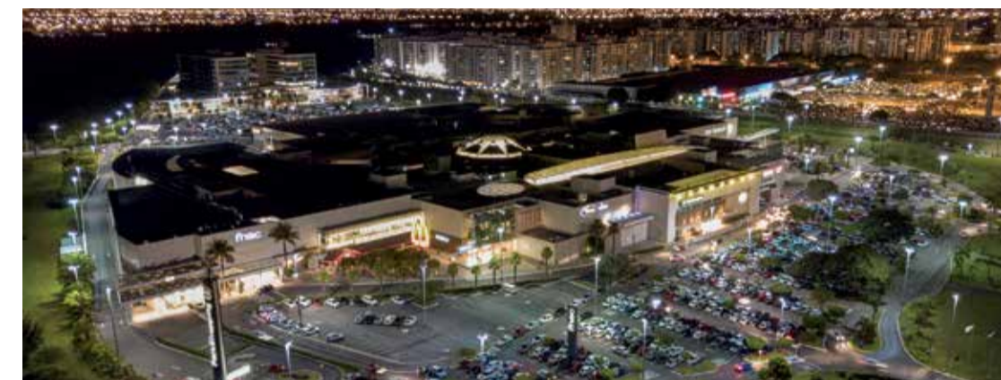
ParkShopping - DF