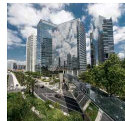
Morumbi Corporate - SP