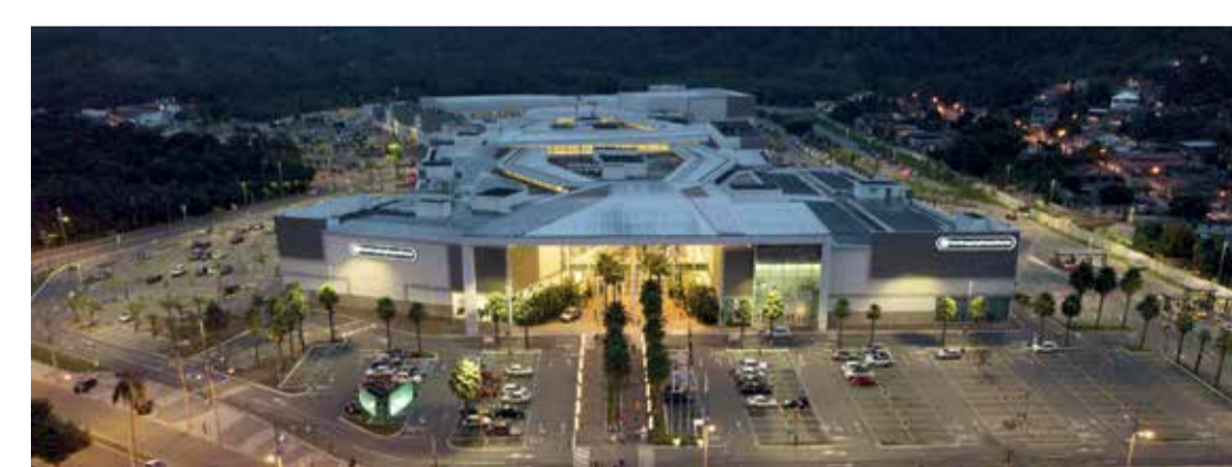
ParkShoppingCampoGrande - RJ