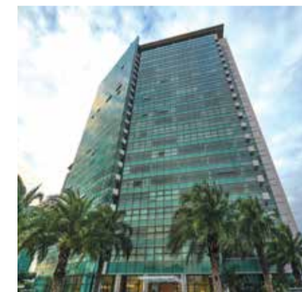
Résidence du Lac - RJ