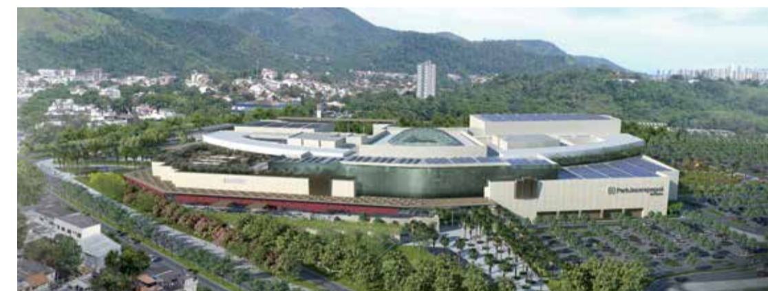
ParkJacarepaguá - RJ