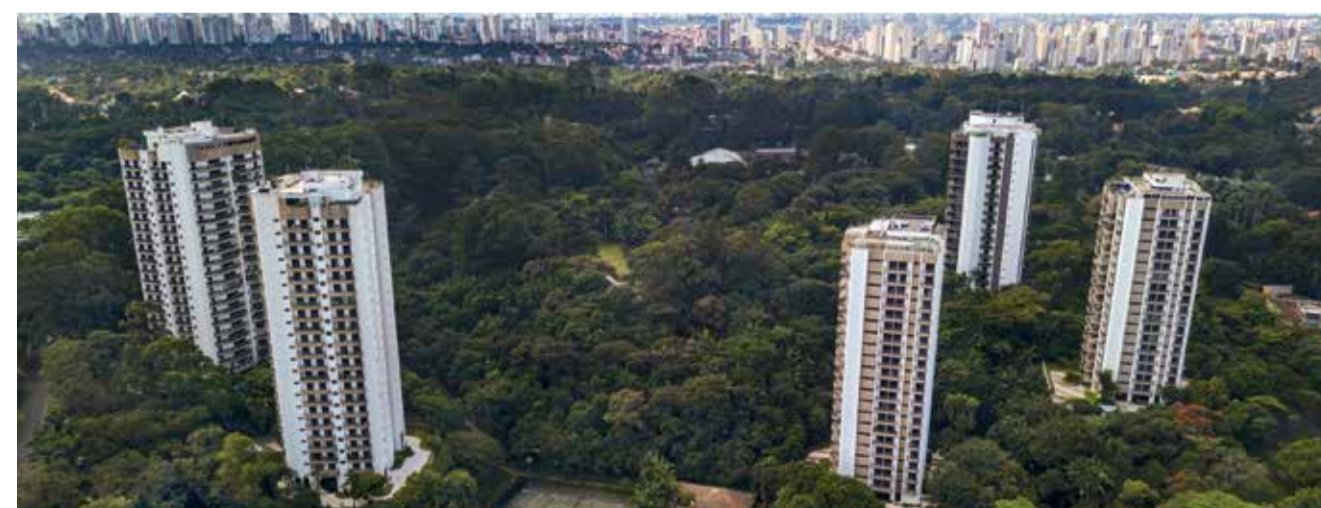
Chácara Santa Elena - SP