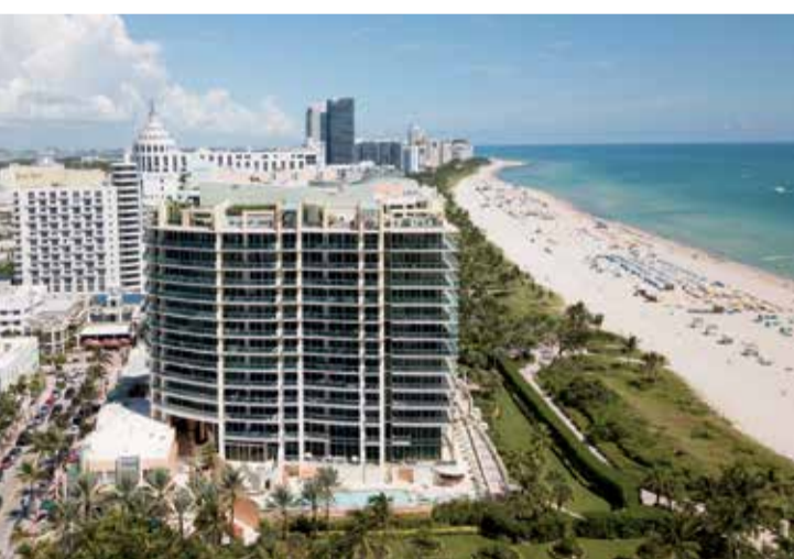
Il Villaggio - Miami - EUA