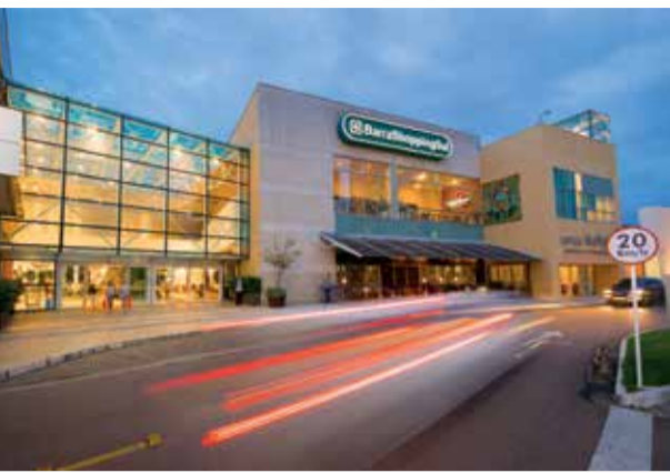
BarraShoppingSul - RS