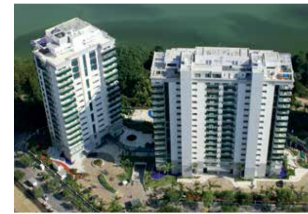
Royal Green - RJ