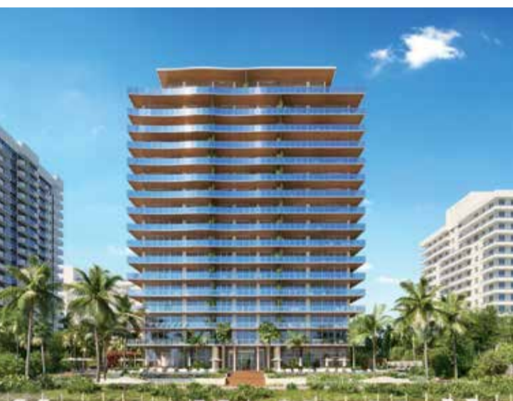
57 Ocean - Miami - EUA