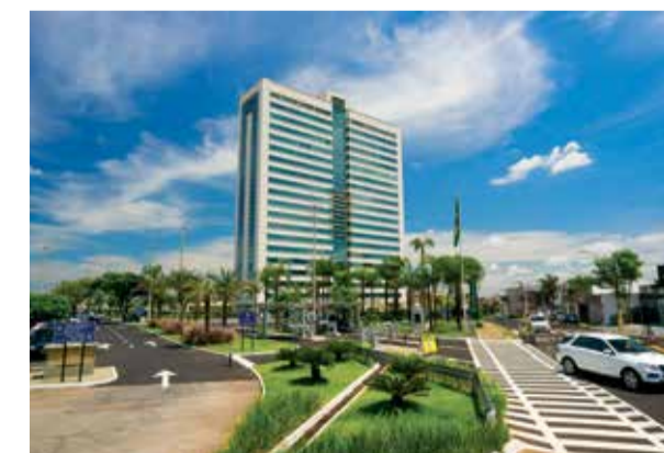
Centro Profissional Ribeirão Shopping - SP