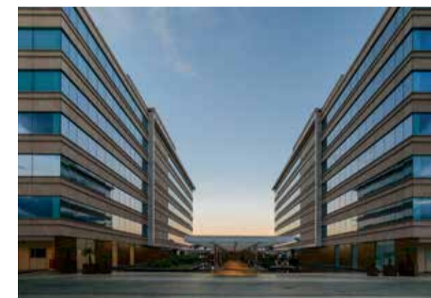
Park Shopping Corporate - DF